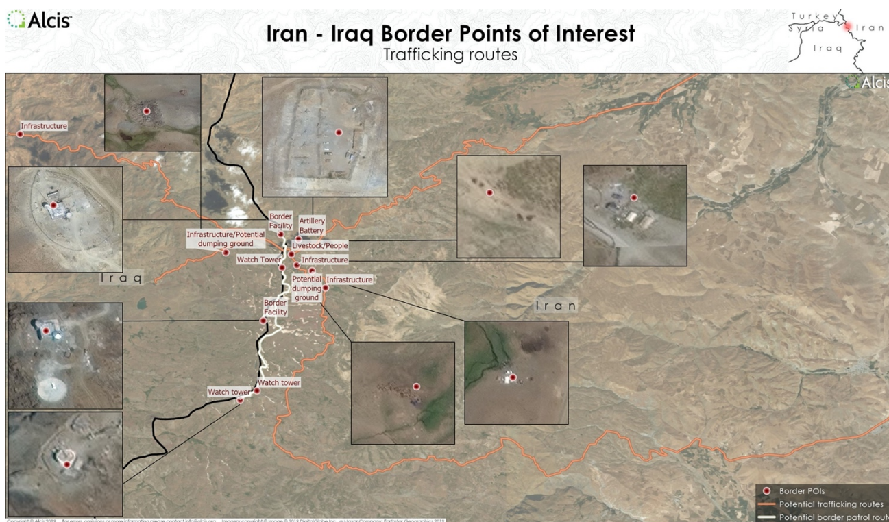
FIGURE 2 Points of interest along a section of the Iran-Iraq border

Based on information provided by key informants, a review of satellite imagery from a section of the border between Iran and the KRI was undertaken (see Figure 2). Through this review, a number of informal crossings were identified based on tracks visibly running across several sections of the border, indicating possible use by vehicles, persons and animals (e.g. donkeys). In addition, several potential sites were identified where smuggled goods could be temporarily stored before being distributed to couriers to be brought across the border. An analysis was also undertaken of formal crossings between Iran and the KRI. Figure 3 shows the growth of the Sheikh Saleh border crossing point between Kermanshah Province in Iran and Sulaymaniyah Governorate (KRI). This location was identified as a point of interest by informants due to the large volume of goods that currently cross on a daily basis and the low level of monitoring by authorities on either side. The Sheikh Saleh crossing was officially approved by the Iranian parliament on 7 August 2019. However, as indicated by key informants and verified by the satellite imagery, it operated as an informal border crossing for several years. The lack of border infrastructure (as seen in the satellite imagery) and monitoring equipment (as highlighted by key informants) underscores the potential for traffickers to exploit this crossing point for the smuggling of illicit goods.