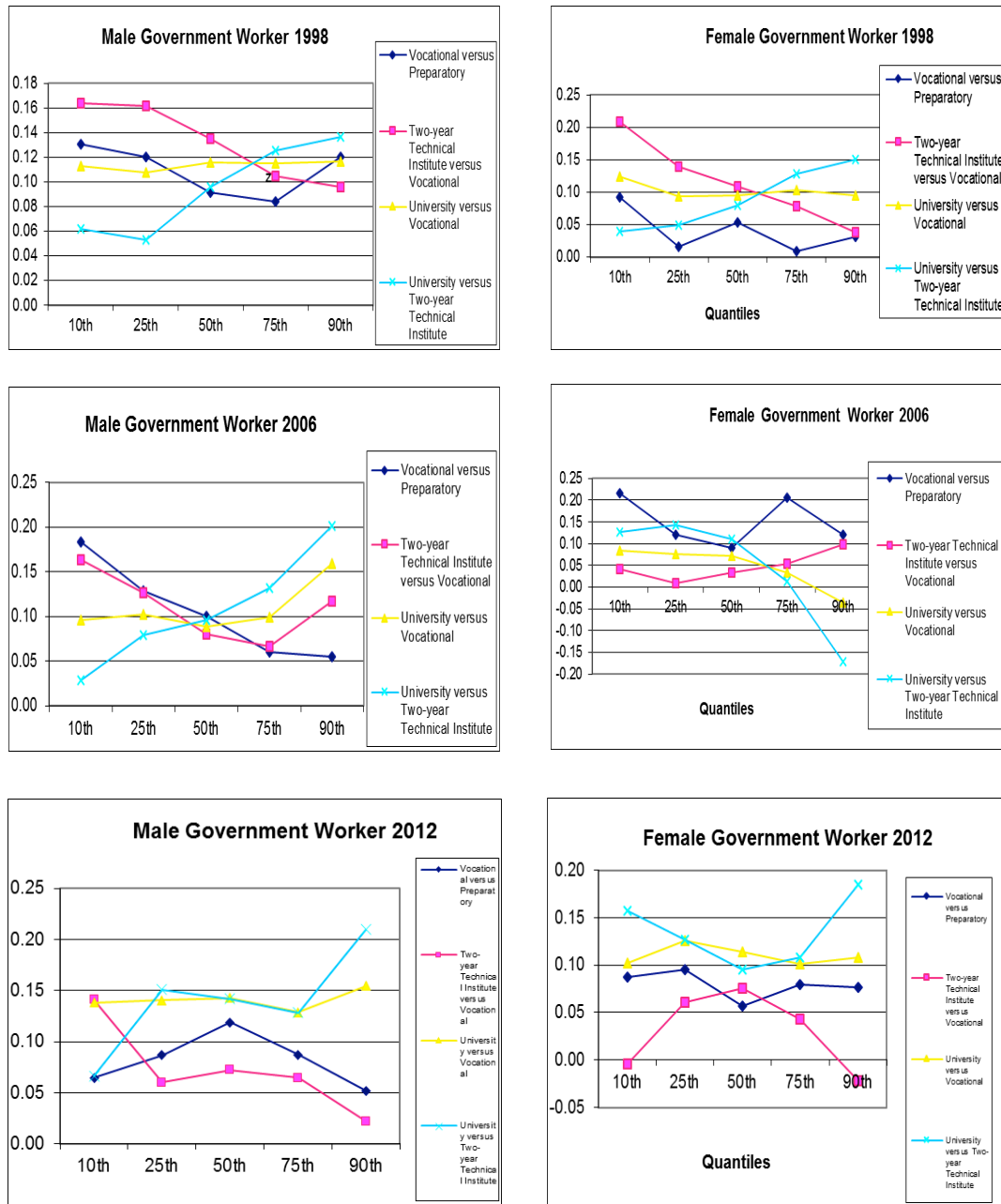
FIGURE 4. Incremental Rates of Return to Education in the Government Sector