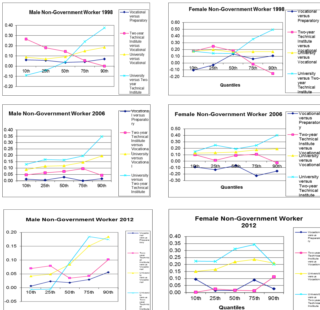
FIGURE 3. Incremental Rates of Return to Education in the Non-Government Sector