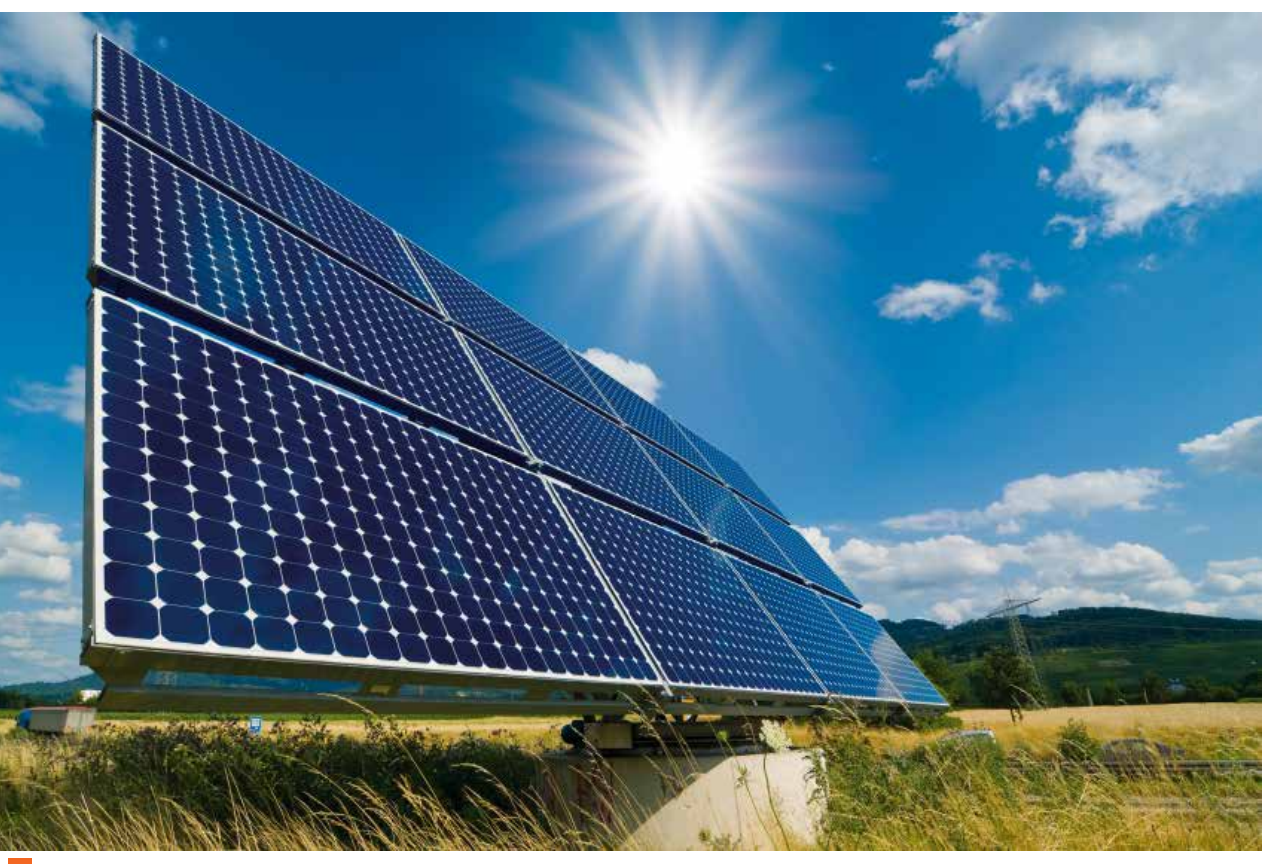
PV system with tracking feature.

Before discussing the challenges, let us elaborate on the policies currently in place regarding investment to increase the domestic generation