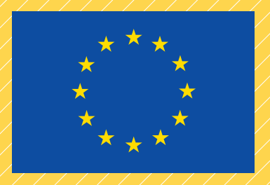
Co-funded by the European Union

EMPOWERING MEDITERRANEAN REGULATORS FOR A COMMON ENERGY FUTURE