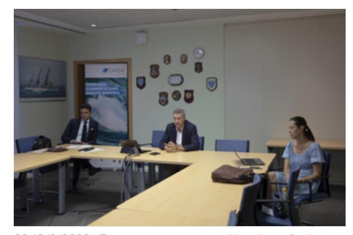
09-10/9/2020 - Training on environmental legislation for the Jordan Maritime Commission

The areas covered were air emissions from ships and greenhouse gases, ships recycling, Ballast Water Management convention, anti-fouling legislation and liability and compensation for maritime pollution.