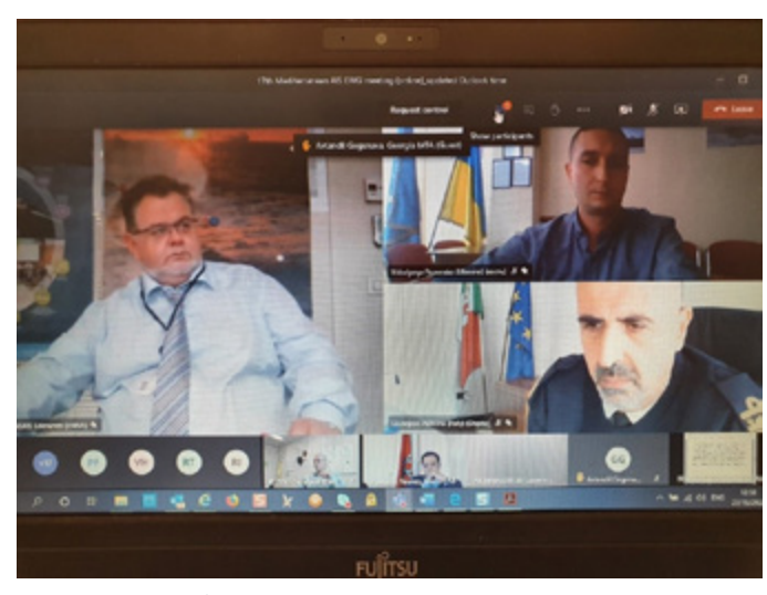
27/10/2020 – 17<sup>th</sup> MARES Expert Working Group (EWG)

The meeting was an opportunity to share considerations on the quantity and quality of data shared by the States participating in MARES with focus on technical solutions to reduce corrupted messages and critical downtimes. EMSA representatives emphasized the importance that Morocco and Tunisia give their green light to the participation to the Phase 2 of the pilot project. Participating EU Member States were informed of the latest ENP Projects' developments and actions planned. Sharing AIS information between EU and non-EU Member States is a tangible example of cooperation adding value to the maritime traffic monitoring in the Mediterranean region.