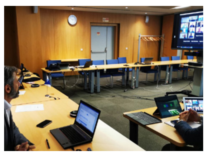
05/11/2020 - 4th SAFEMED IV Steering Committee meeting.

conventions and the support to develop and implement QMSs for maritime administrations were presented as available options for beneficiaries during the last year of implementation of the project. Attending beneficiaries presented their priorities and expectations for the timeframe 2020-2021, thus contributing to the Action Plan that was endorsed by the Steering Committee.