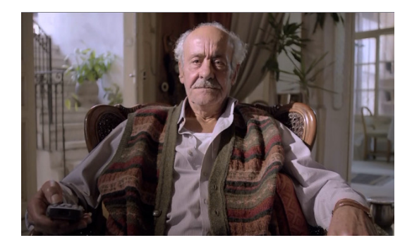
TEC-MED TRANSCULTURAL CARE MODEL: AN INNOVATIVE APPROACH TO ADRESS ELDERLY'S NEEDS IN