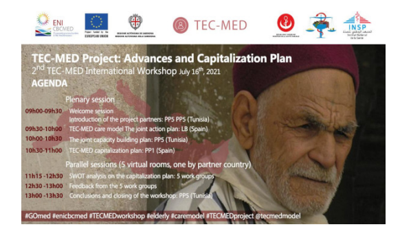
TEC-MED VALIDATES ITS CAPACITY BUILDING PLAN TO IMPROVE ELDERLY'S LIVES AROUND THE