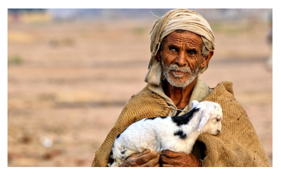
THE TEC-MED CAPACITY BUILDING PLAN IS A FUNDAMENTAL PILLAR TO