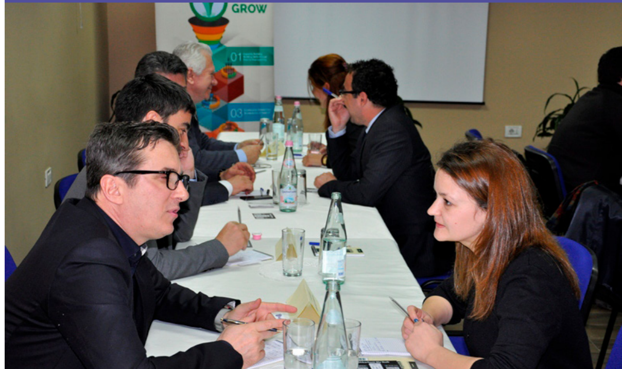
UfM-labelled project CEED Grow - Med4Jobs Initiative (Albania)

The Euro-Mediterranean region has one of the highest unemployment rates in the world , affecting mostly young people and women, making job creation a pressing priority for UfM countries. Inclusive, sustainable and decent employment for all has thus acquired a priority position in policymaking in the region, being indispensable for economic growth, social cohesion and the eradication of poverty.