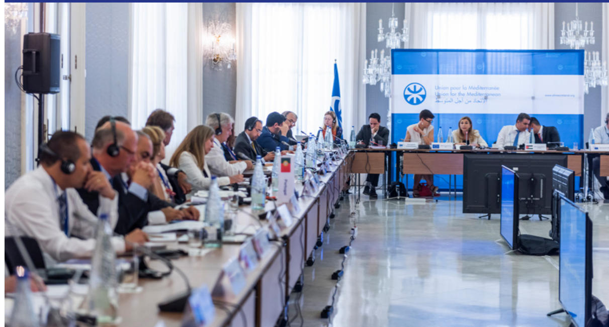
UfM Senior Officials' Meeting (SOM)

The Euro-Mediterranean region has faced unprecedented challenges to its stability and security over the last few decades. One of the primary goals of the UfM is to strengthen political dialogue amongst its 43 member states with a view to building peace, security and stability in the region.