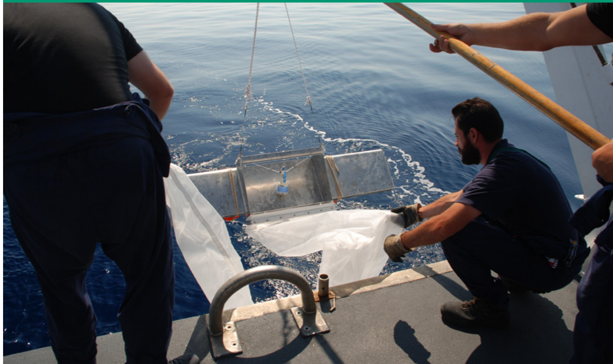
UfM-labelled project Plastic Busters (Italy)

The Mediterranean region is one of the world's 25 climate change hotspots, facing environmental threats to its biodiversity, natural resources and habitable areas . Furthermore, millions of marine animals die every year because of polluted oceans, while 18% of Mediterranean species are already threatened with extinction.