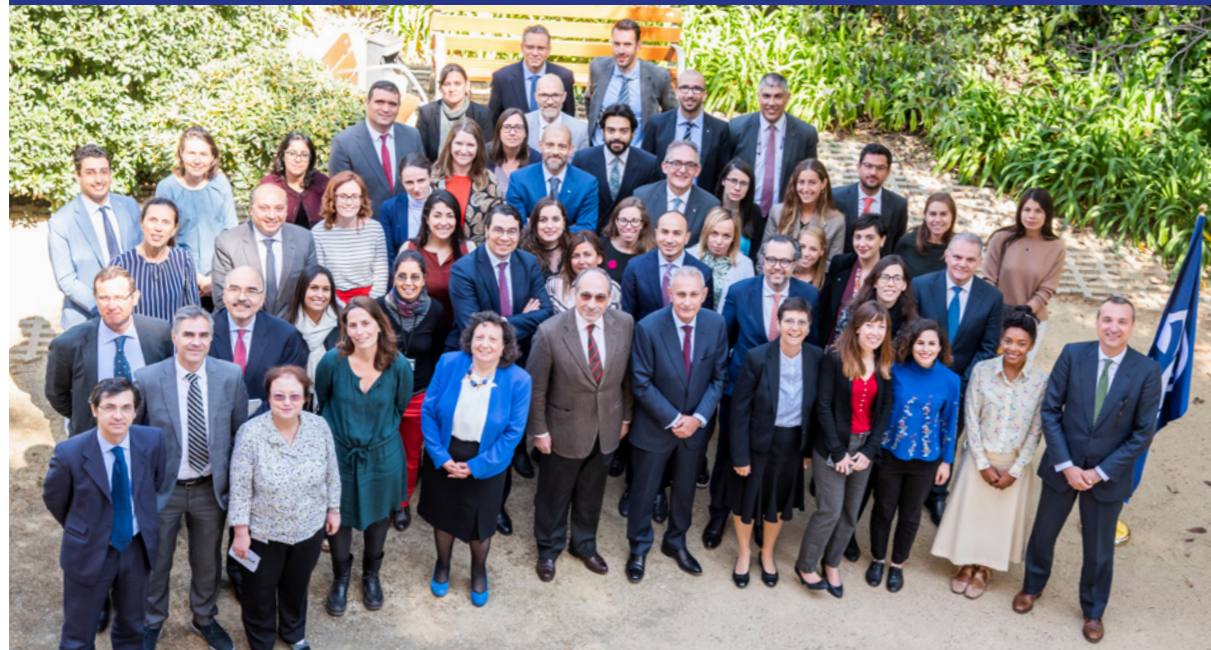
UfM Secretariat team