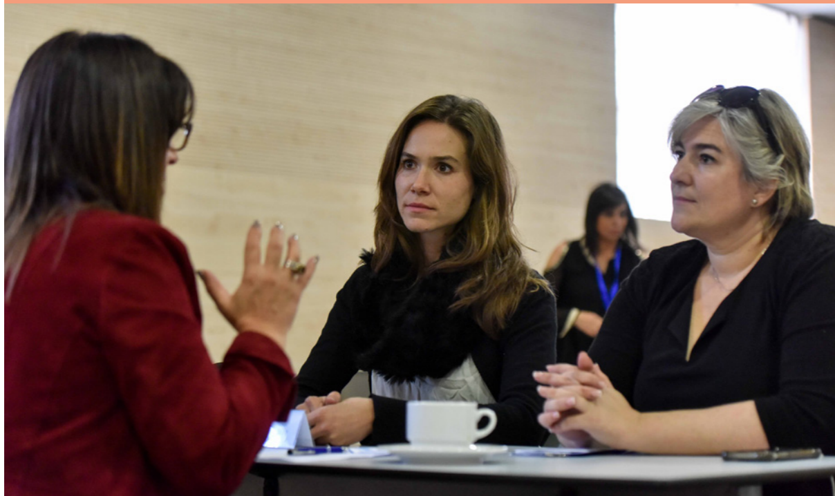
Women Entrepreneurship & Investment Programme - WEIP (Spain)

All over the world, an unprecedented upsurge of movements has marked a historic turning point in the fight for women's rights and equality , and the Euro-Mediterranean region is no exception.