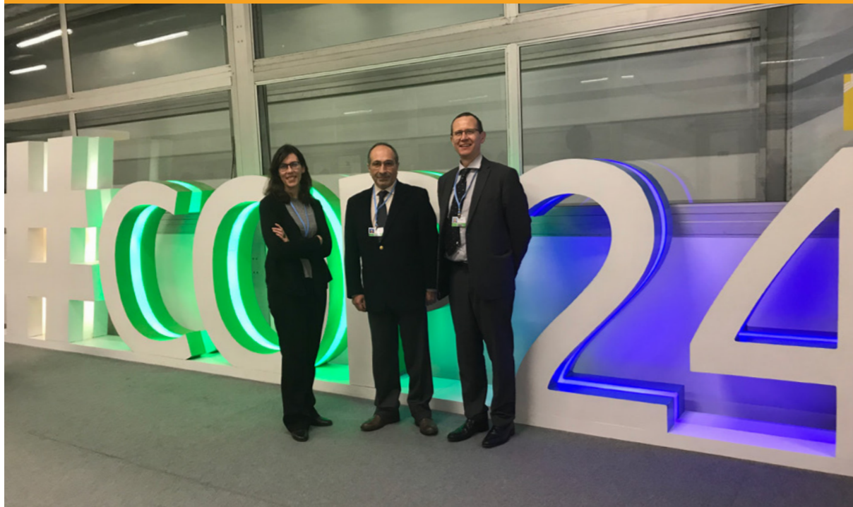
UfM Secretariat at COP24 (Poland)

The Mediterranean region is one of the world's climate change hotspots where, according to the Intergovernmental Panel on Climate Change (IPCC), the limit of a rise in temperature of 1.5°C set by the Paris Agreement is already being exceeded .