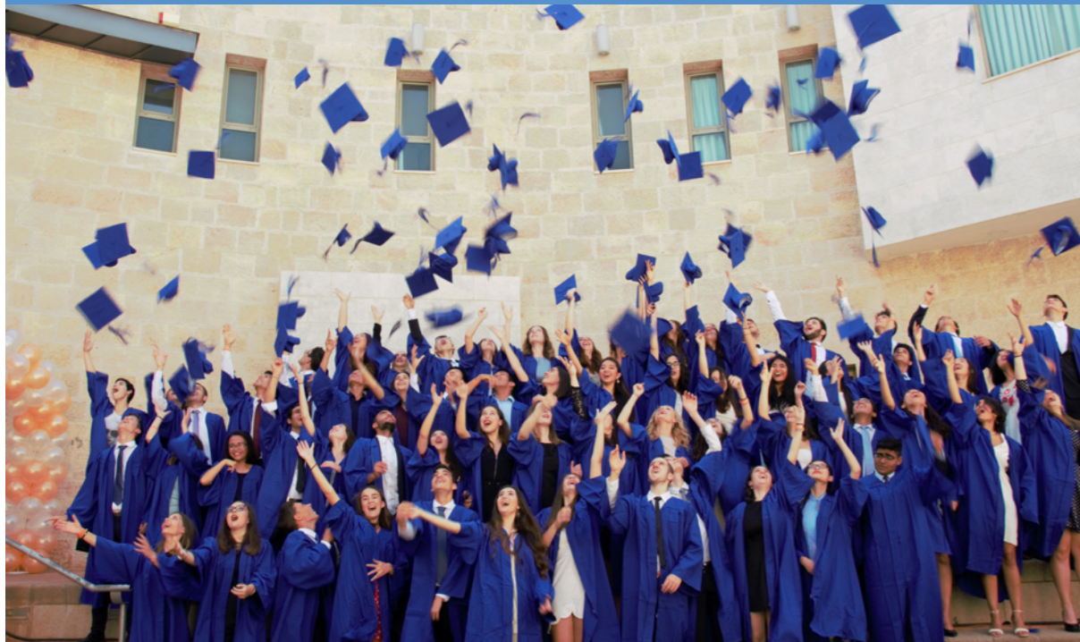
UfM-labelled project Eastern Mediterranean International School (Israel)

The UfM region includes over 30 million university students and, by 2030, higher education enrolment rates are expected to rise to 40%. This “youth bulge” is dramatically changing the educational landscape, yet the situation in the region means that young people’s ambitions often go unfulfilled, despite being the most educated southern Mediterranean generation ever.