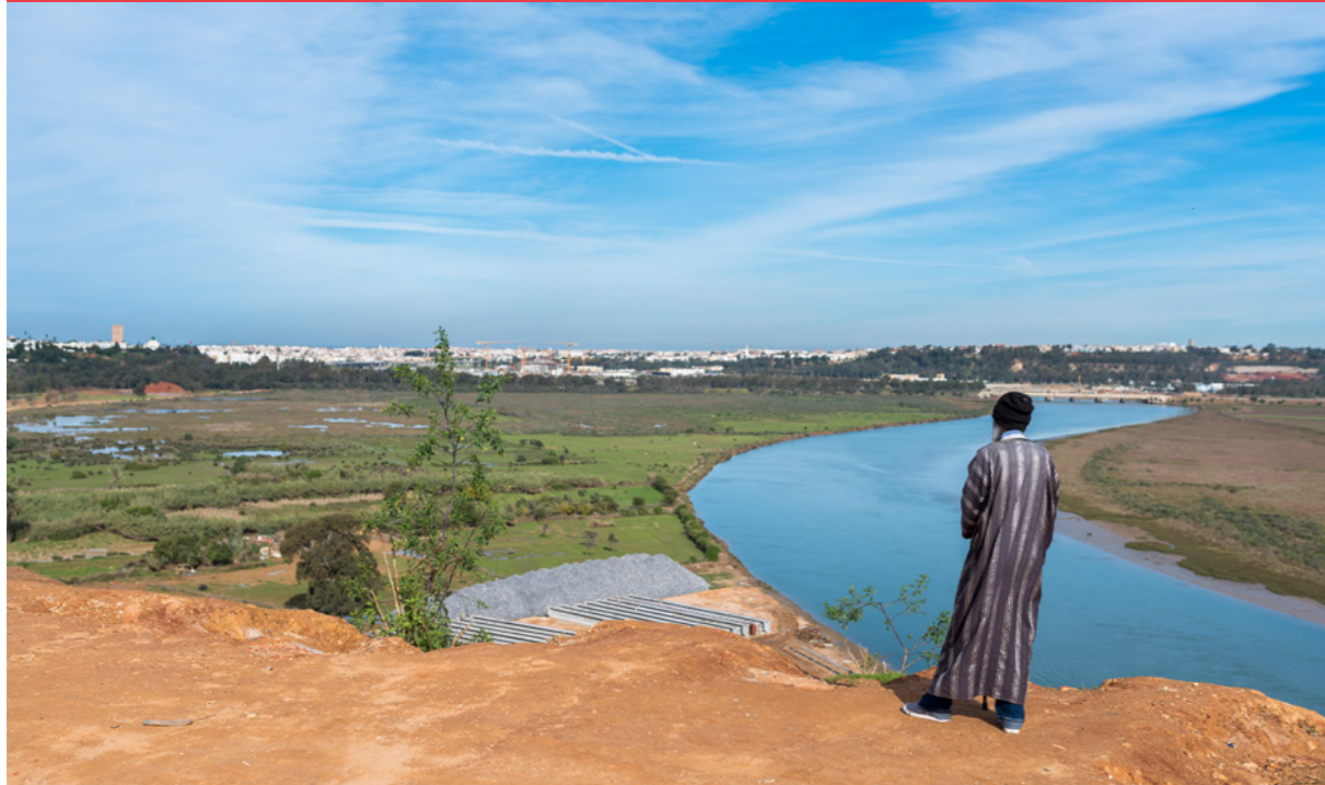
UfM-labelled project UPFI Bouregreg Valley (Morocco)

The Mediterranean region is characterised by one of the fastest urbanisation rates worldwide, with almost 60% of the total population already living in urban areas . By 2030, nearly 80% of the Southern Mediterranean population will be concentrated on just 10% of the land, predominantly on the coast.