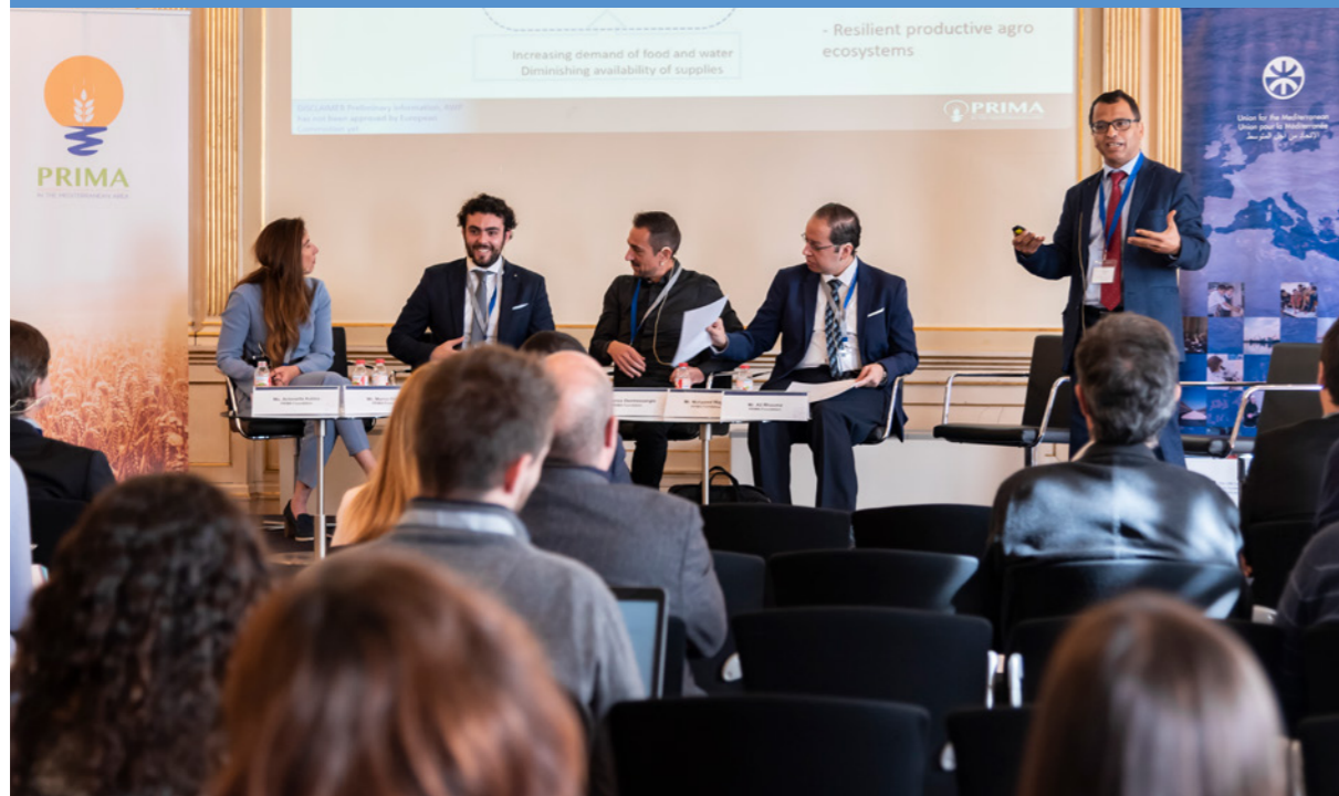
PRIMA Info Day at the UfM Secretariat

Research and innovation are vital for inclusive human progress. Research offers policymakers scientific grounds for decisions based on data and hard facts. It helps us to understand the world's problems , and plays a key role in moving towards a sustainable future. Meanwhile, innovation helps bridge the gap between economic activities and respect for the environment, unlocking the potential of sustainable growth .