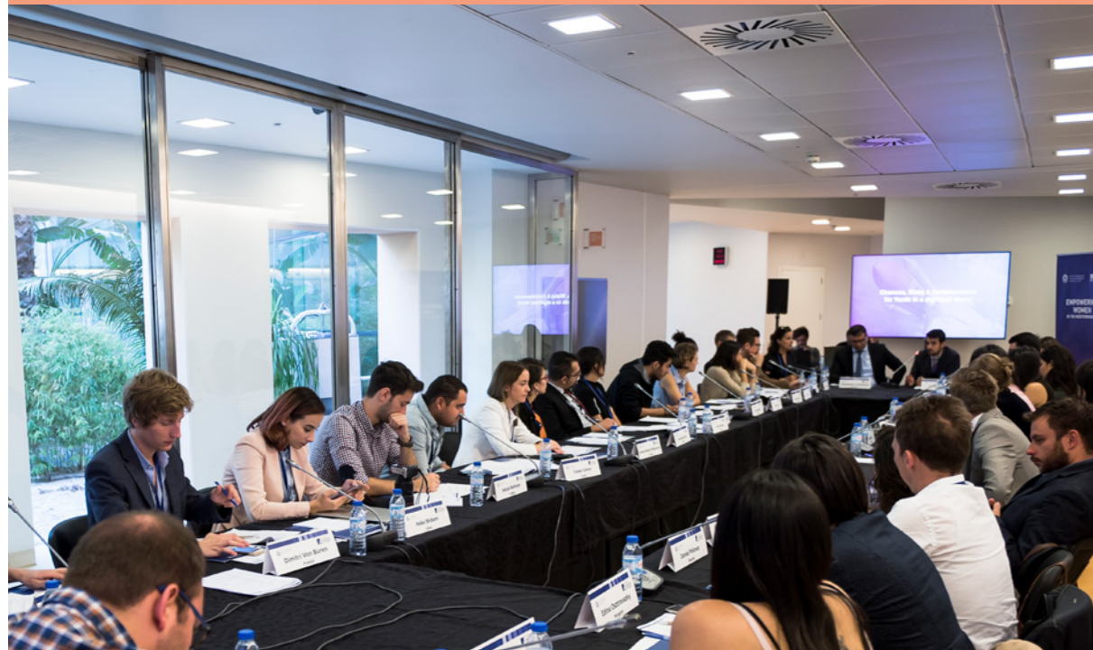
Euro-Mediterranean Youth Forum "Shaping The Digital Future" (Portugal)

Never before has the world been home to so many young people. At 1.8 billion, this generation represents an unprecedented potential for global economic and social progress.