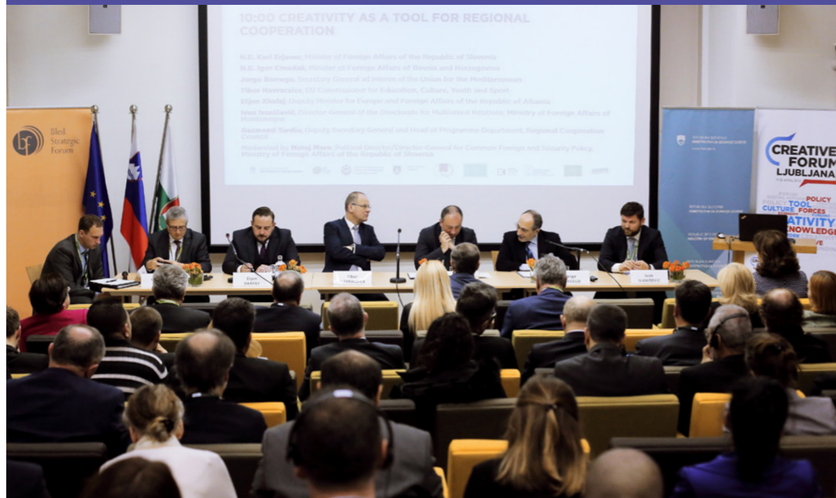
Creative Forum Ljubljana (Slovenia)

The Euro-Mediterranean region has one of the lowest levels of regional integration in the world . A study commissioned by the UfM Secretariat has shown that, out of all trade flows occurring in the region, 90% are within the European Union, 9% between the North and the South, and only 1% among southern and eastern Mediterranean countries themselves.