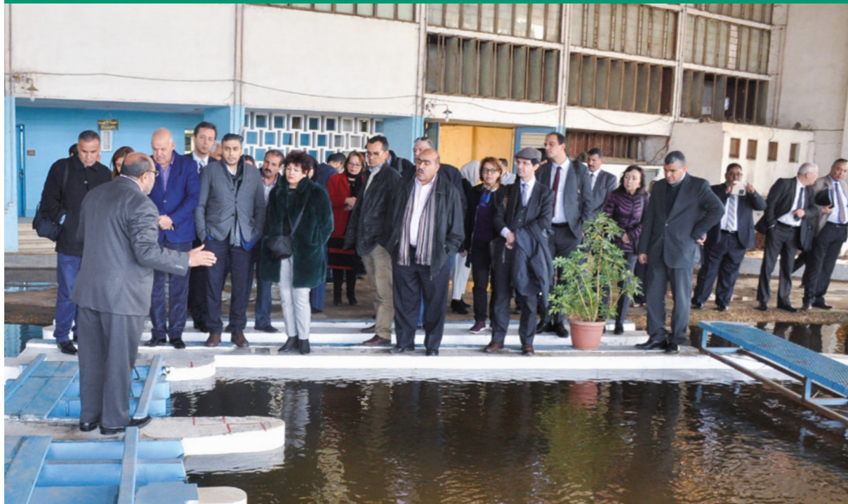
3 rd Mediterranean Water Forum (Egypt)

The Mediterranean region is one of the most water-scarce areas in the world , with more than 180 million people living in circumstances where the water conditions are considered poor, and an additional 60 million facing water stress. Moreover, water quality is another factor posing major problems to water users and the sustainability of our ecosystems.