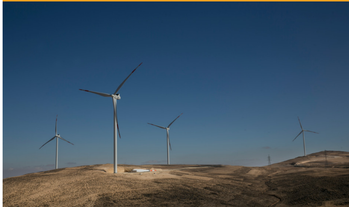
UfM-labelled project Tafila Wind Farm (Jordan)

It is widely accepted that moving to a sustainable, low-carbon economy cannot be achieved by central governments alone. As a shared, global responsibility, all actors in society need to be involved , from local authorities to the private sector and civil society.