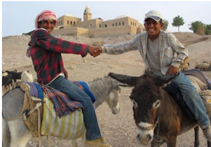
Members of the Bedouin community who will be benefiting from the rehabilitation of Maqam Nabi Musa in Jericho, in the background.

But much work remains to be done. To respond successfully to global crises, threats, and challenges, the international community needs an efficient multi-lateral system that is founded on universal rules and values. The Arab States region faces multi-faceted challenges of every type and size, and in the coming years the EU and UNDP will continue our joint effort to preserve peace, prevent conflicts and strengthen international security while keeping the region on a sustainable development path guided by the 2030 Agenda. No person or community should be left behind, and though the future will doubtless hold many unexpected challenges, one thing will remain constant – the EU and UNDP will always help more communities when we work together.