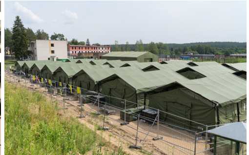
Clockwise from the top: Migrants risking a perilous journey across the Mediterranean; Frontex officer interviewing a newly arrived migrant; port authorities in Sicily undertaking security checks; tent camp in Lithuania being used to house migrants arriving from Belarus.