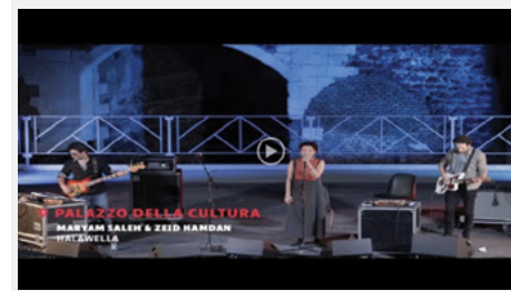
Festival of Mediterranean Citizens overview