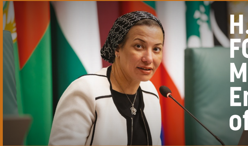
H.E. YASMINE FOUAD, the Minister of Environment of Egypt

underlined the importance of the circular economy and drew attention to the initiatives promoted at COP27, which took place last year, under the presidency of Egypt, such as Food and Agriculture for Sustainable Transformation (FAST).