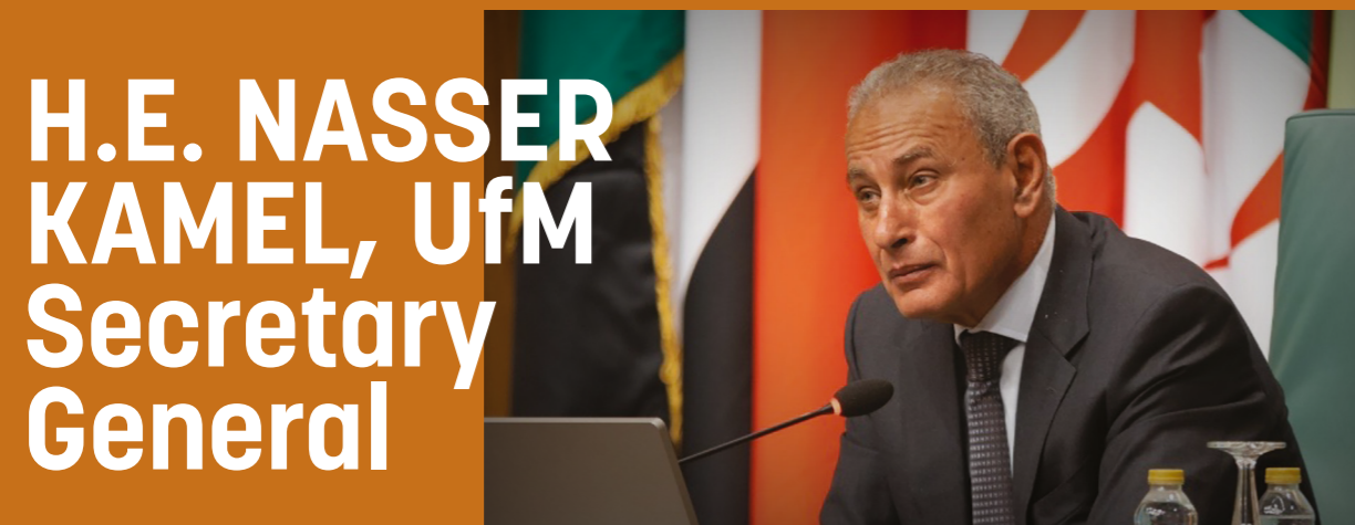
H.E. NASSER KAMEL, UfM Secretary General

declared that the Conference came in difficult economic and political circumstances, highlighting that the fostering of food industries requires strong cooperation among Arab countries and between them and UfM countries.